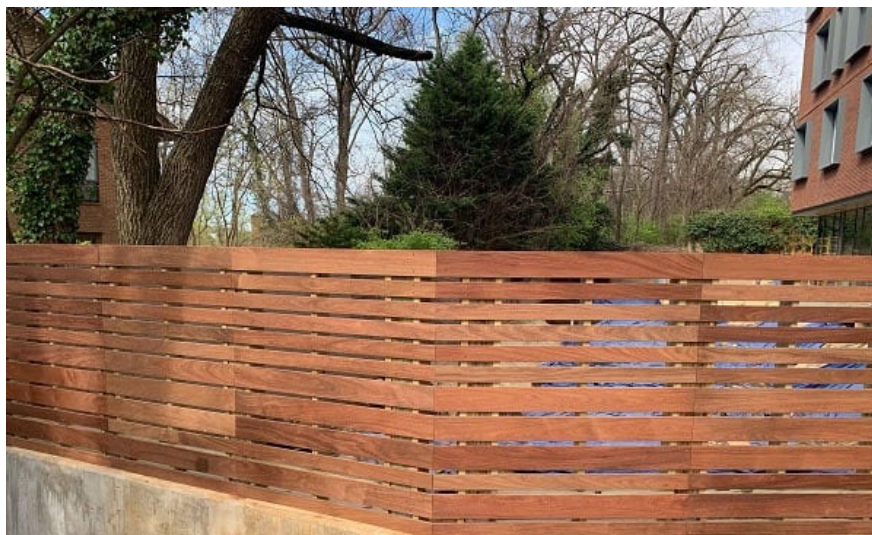
Machiche wood fencing

Mahogany, Cedar, Santa Maria, and Pine are the most common wood species being harvested in Guatemala. Machiche is an up-and-coming species though. Machiche isn't just a pretty face. Machiche is every bit as hard, dense, strong, and durable as it is beautiful. Machiche hardwood makes excellent decking, trim, and siding boards.