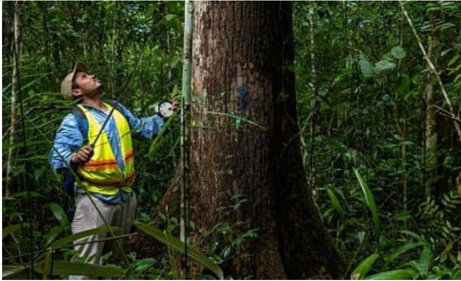
The concessions and the forestry practices where the Machiche is harvested are also FSC Certified.

How well is the community model working? With near zero percent deforestation, this community-based model boasts the best performance of forest stewardship anywhere on earth.