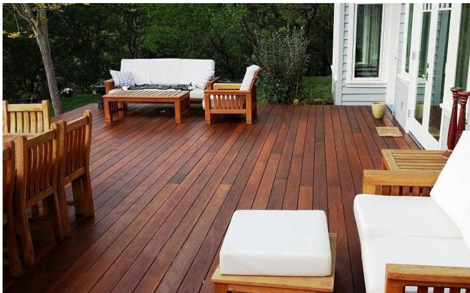
Machiche backyard deck with oil finish