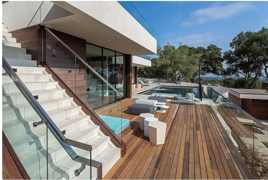
Machiche hardwood decking, siding, and trim on a home

With Machiche hardwood, the sustainability aspects don't stop at the forest. Machiche is so durable, it has an extended usable lifetime, even outdoors. This means lower overall lifecycle costs. And low lifecycle costs are one of the hallmarks of sustainable design and green building practices.