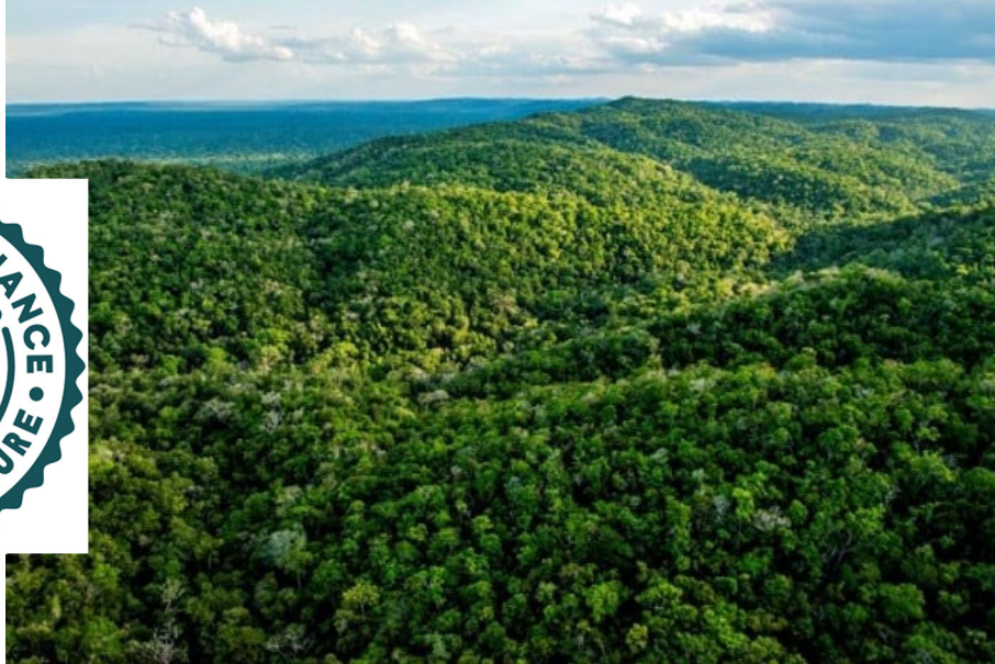
The Maya Biosphere Reserve